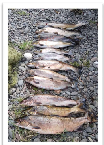
3 salmon and 7 sea trout were found in the net

One of the most serious poaching incidents in recent years has ended up with a successful prosecution at Newcastle Magistrates Court. Three men from the Eyemouth and Berwick area were fined a total of £2,322 for the use and possession of a trammel gill net on the River Till.