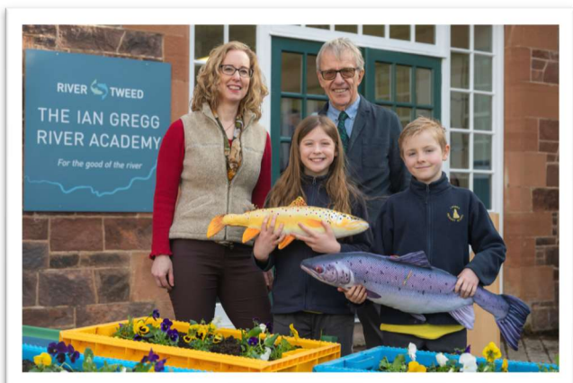
Our guests, just before cutting the ribbon