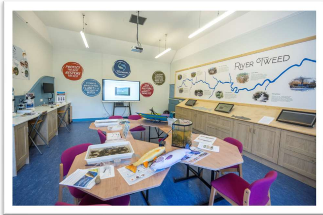
The visitor room has new interactive touch screens, presentation screen and bench area with microscopes

An overhaul of the visitor room at our Drygrange office to turn it into a 21 st century venue for delivering education sessions to all ages has now been completed.