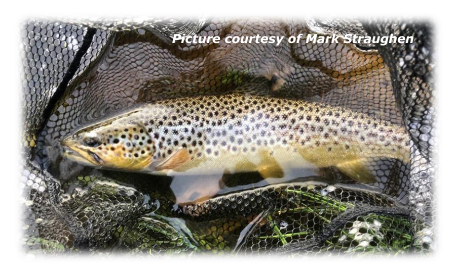
The catch rate for Brown Trout between 25cm (10") and 35cm (14") in May, June and July 2020 was the highest on record

Brown Trout catch log book returns for the Lower Tweed for the 2020 season were below the usual return rate. This is most likely as a result of limitations put on ticket sales by some Angling Associations in light of COVID-19 restrictions which were in place when angling opened up in late May. This likely indicates that Brown Trout angling effort was lower than would normally be the case in some areas.