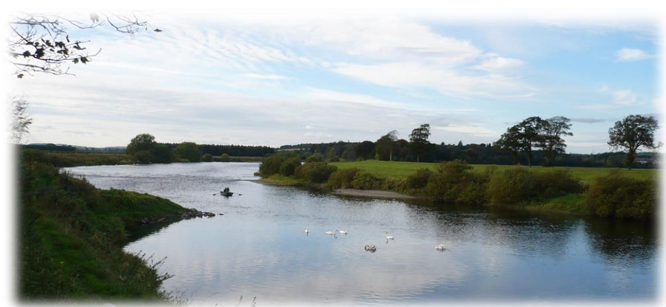
Both the Brown Trout and Grayling catches were well above average in the Lower Tweed during 2020

The Brown Trout and Grayling catches in the Middle and Upper Tweed during the 2020 fishing season mirrored those from the Lower Tweed.