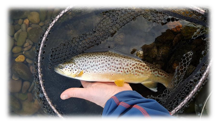
The catch rate for Brown Trout between 10" and 14" during May and June 2020 was the highest on record

2020 Middle Tweed Brown Trout Catch Summary