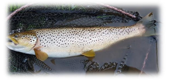
This Brown Trout from the Middle Tweed was caught and photographed in each of the 2017, 2018 and 2019 trout fishing seasons

During the last few seasons we have been asking anglers to take pictures of the left side of the Brown Trout they catch. This allows us to identify individual trout from the spot pattern on their gill cover and record movements and recaptures. Although only a small number of anglers have participated to date, the results have been eye-opening with localised movements, multiple recaptures, and recaptures in successive seasons all being recorded. If you can help us by photographing the trout you catch from either the Melrose & District or St Boswells, Newtown & Districts Angling Association waters please contact Kenny Galt at: