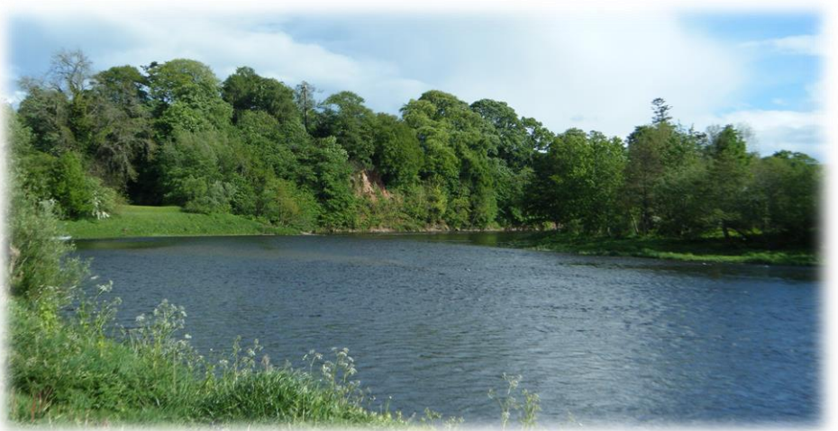
Although catch rates are highly variable from one year to the next, the overall catch trend from the Middle Tweed is unchanged

Since the current recording scheme began in 2006, the Brown Trout catches have varied substantially from one year to the next. However, the overall trend for Brown Trout over 25cm (10") shows neither an increase nor decrease in catch rates. The overall catch trend for undersize trout (<25cm) is one of slightly improving catches.