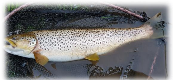
This Brown Trout from the Middle Tweed was caught and photographed in each of the 2017, 2018 and 2019 trout fishing seasons

During the last few seasons we have been asking anglers to take pictures of the left side of the Brown Trout they catch. This allows us to identify individual trout from the spot pattern on their gill cover and record movements and recaptures. Although only a small number of anglers have participated to date, the results have been eye-opening with localised movements, multiple recaptures, and recaptures in successive seasons all being recorded. If you can help us by photographing the trout you catch from either the Melrose & District or St Boswells, Newtown & Districts Angling Association waters please contact Kenny Galt at: kgalt@tweedfoundation.org.uk , or through the Tweed Foundation's Facebook page.