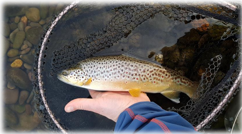
The catch rate for Brown Trout between 10" and 14" during May and June 2020 was the highest on record

Brown Trout catch log book returns for the Middle Tweed for the 2020 season were below the usual return rate. This is most likely as a result of limitations put on ticket sales by some Angling Associations in light of the COVID-19 restrictions which were in place when angling opened up in late May. This likely indicates that Brown Trout angling pressure was lower than would normally be the case in some areas.