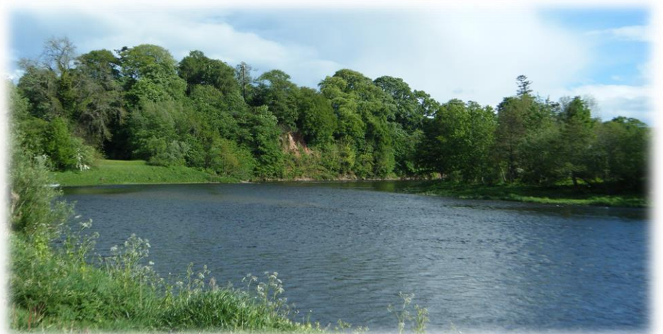
Although catch rates are highly variable from one year to the next, the overall catch trend from the Middle Tweed is unchanged

Since the current recording scheme began in 2006, the Brown Trout catches have varied substantially from one year to the next. However, the overall trend for Brown Trout over 25cm (10") shows neither an increase nor decrease in catch rates. The overall catch trend for undersize trout (<25cm) is one of slightly improving catches.