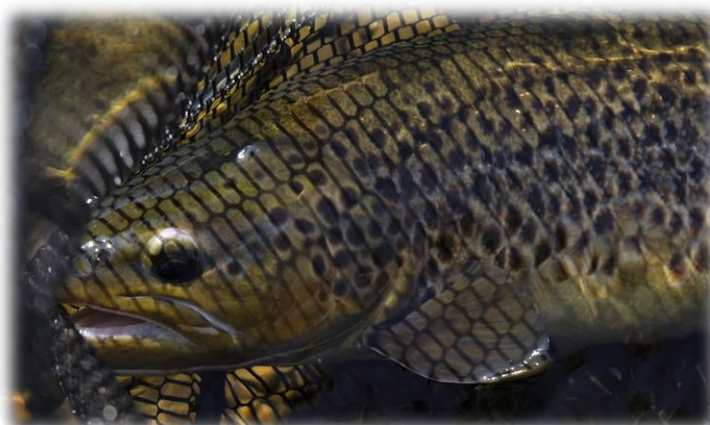
This Brown Trout from the Yarrow was caught in both May and September 2019 by two different anglers

kgalt@tweedfoundation.org.uk , or contact us via the Tweed Foundation's Facebook page.