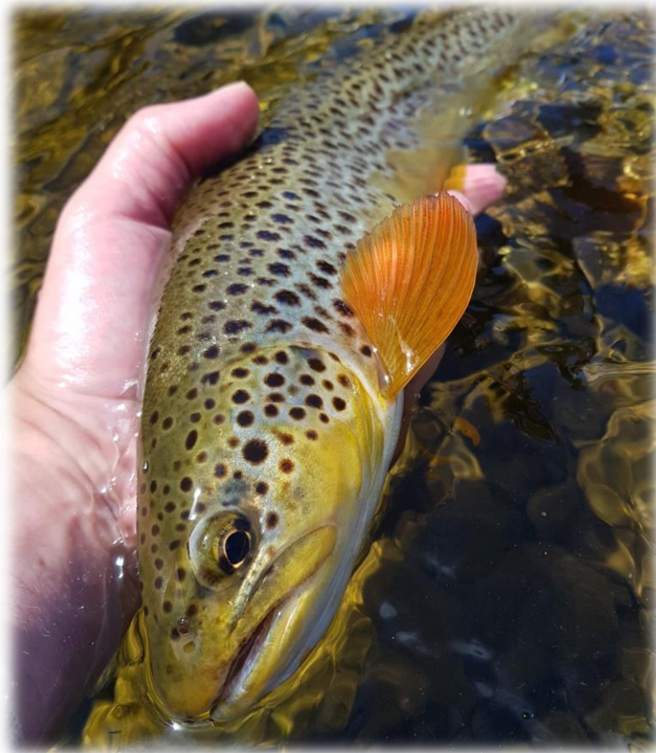
Oversize (10"+) Brown Trout catches from the Ettrick & Yarrow were above average during the 2020 trout fishing season.

The catch rates for undersize (<10") and oversize (10"+) trout on the Ettrick & Yarrow contrasted starkly during the 2020 trout fishing season, with below average catches of undersize trout and above average catches of oversize trout. The above average oversize catches were mostly as a result of well above average catches of Brown trout between 12" and 16" (3/4lb to 1½lb). This was all the more impressive given that April and May, which are normally two of the best months for catching larger Brown Trout, were largely unfished as a result of the COVID-19 lockdown.