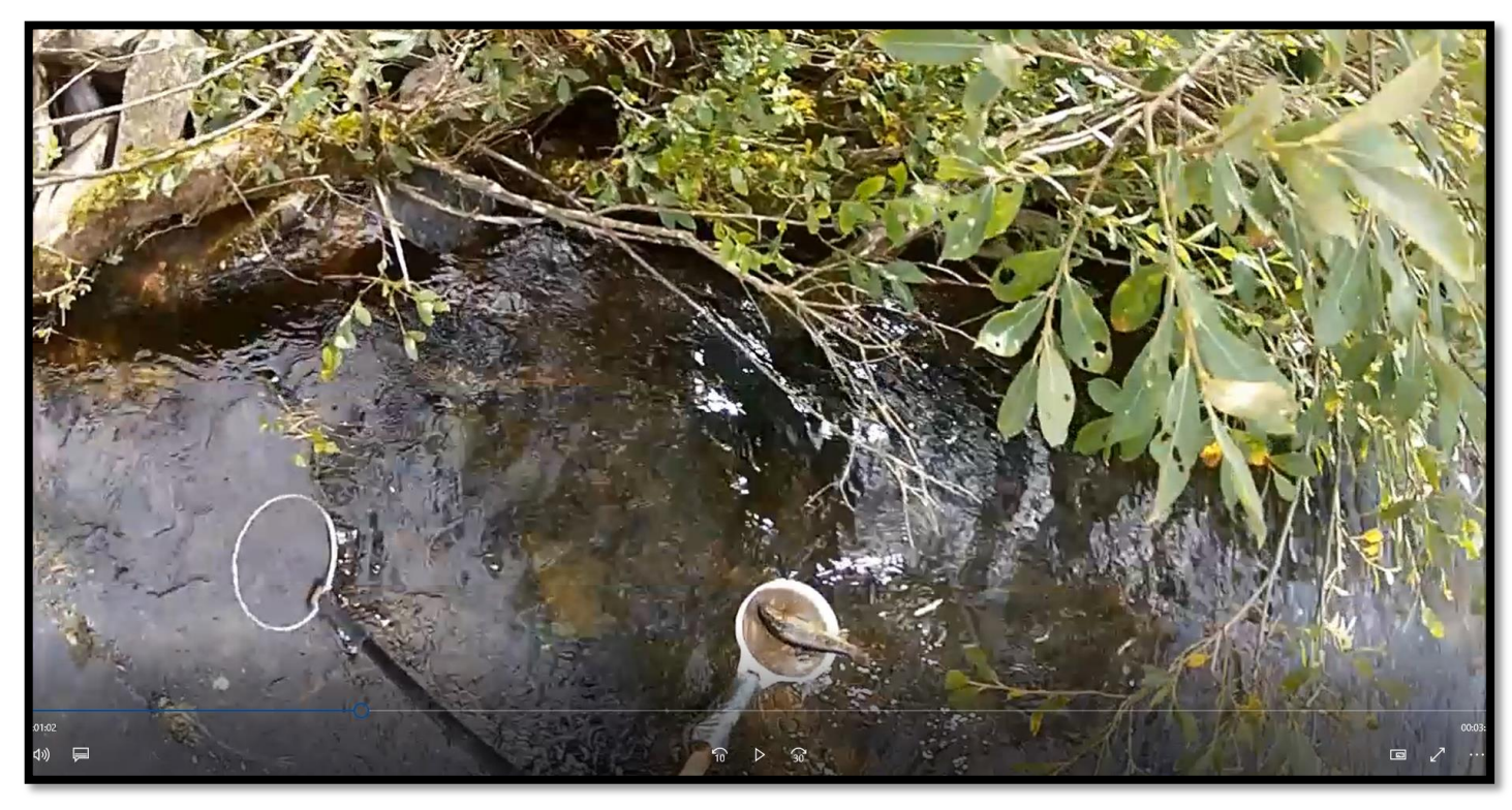
Videos showing electro-fishing in action can be found on The Tweed Foundation's YouTube page.

In September The Tweed Foundation will be carrying out an electro-fishing survey of the juvenile trout and salmon of the River Ettrick. Anyone wishing to come along to see the health of the Ettrick juvenile stocks is more than welcome (assuming COVID-19 restrictions allow) and should contact The Tweed Foundation on 01896 848 271 or Kenny at kgalt@tweedfoundation.org.uk