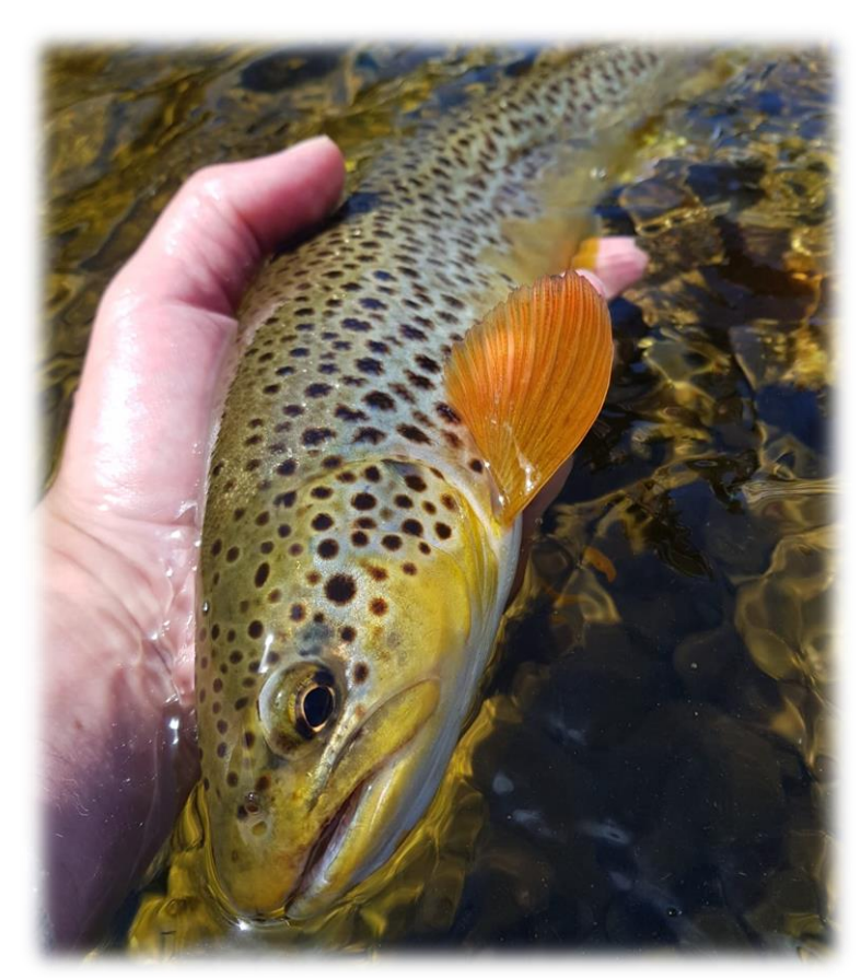
Oversize (10"+) Brown Trout catches from the Ettrick & Yarrow were above average during the 2020 trout fishing season.