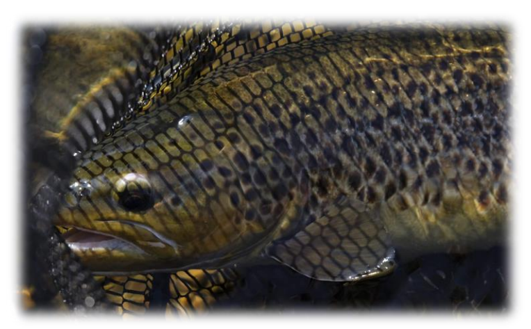
This Brown Trout from the Yarrow was caught in both May and September 2019 by two different anglers

Over the last few years we have had a small number of anglers send in pictures from the Ettrick & Yarrow (thank you to the anglers!) and we would like more, particularly from the